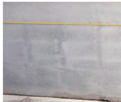
SCC (above) results in nearly zero surface defects, especially when compared to standard concrete (below).

both rate and degree of flow - to allow for a wider variety of placement and construction means and methods.